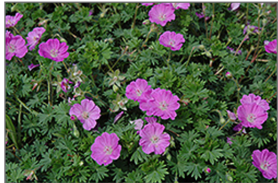
Little Bead Cranesbill flowers

Little Bead Cranesbill is recommended for the following landscape applications;