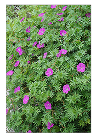
Cedric Morris Cranesbill flowers

Showy, long-lasting, saucer-shaped flowers are a beautiful magenta pink with purple stripes; both flowers and leaves are larger than the species; deadhead spent flowers for reblooming later in the season