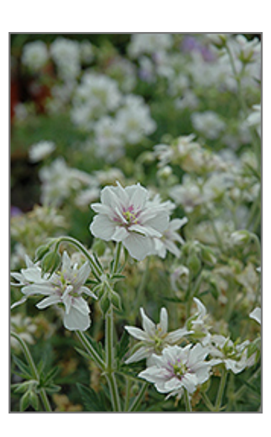
Double Jewel Cranesbill flowers

A more unusual type of geranium with double, white, star-shaped blooms with purple centers; deadhead spent flowers for reblooming later in the season: will bloom in the heat of summer