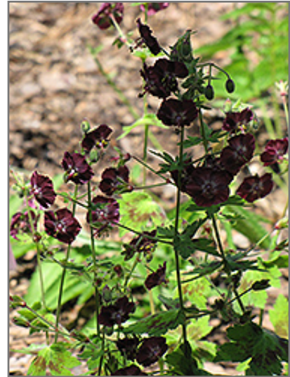
Samobor Cranesbill in bloom

Samobor Cranesbill is recommended for the following landscape applications;