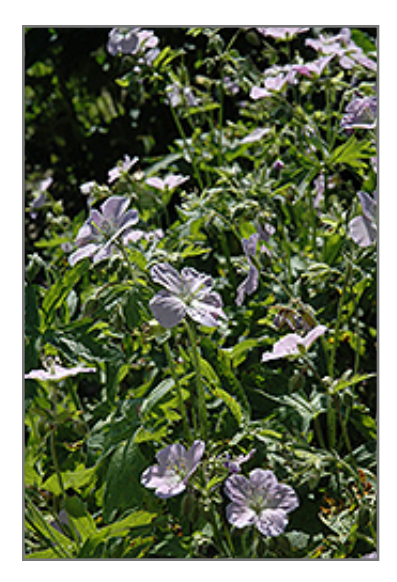
Chatto Wild Cranesbill flowers

Large, coarse, dark-green leaves with deep veins provide interesting texture; this mounded plant is bathed in pale pink saucer shaped blooms; deadhead spent flowers for reblooming later in the season