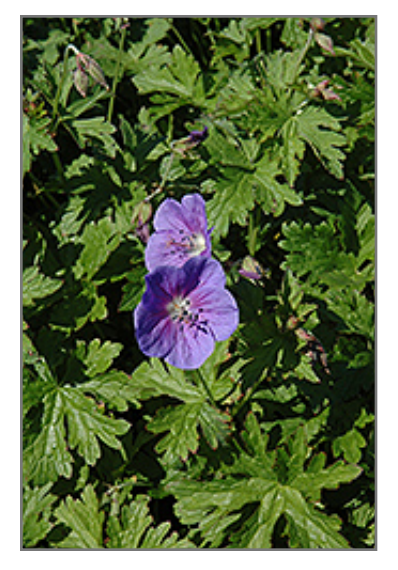
Gravetye Cranesbill flowers

This mat forming geranium makes a great groundcover and rock garden plant; this beauty is bathed in violet-blue saucer shaped blooms with rosy glow around a white center; deadhead spent flowers for reblooming later in the season