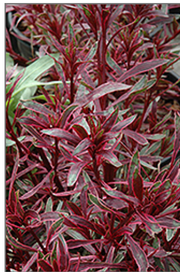
Passionate Rainbow Gaura foliage