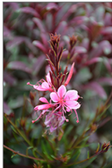
Passionate Rainbow Gaura flowers

Passionate Rainbow Gaura is recommended for the following landscape applications;