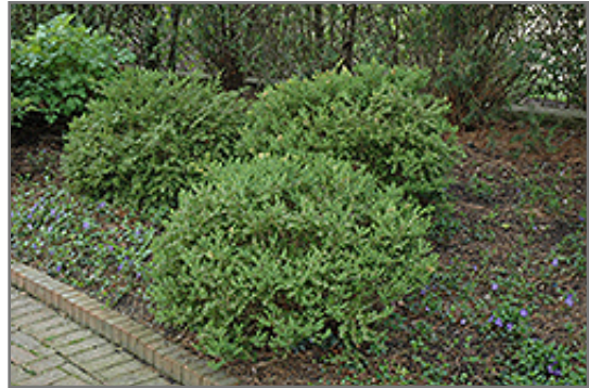
Wintergreen Boxwood