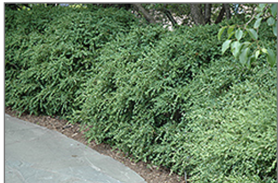
Wintergreen Boxwood