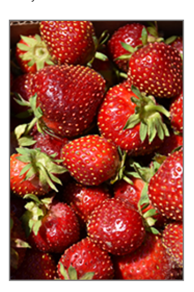
Sparkle Strawberry fruit