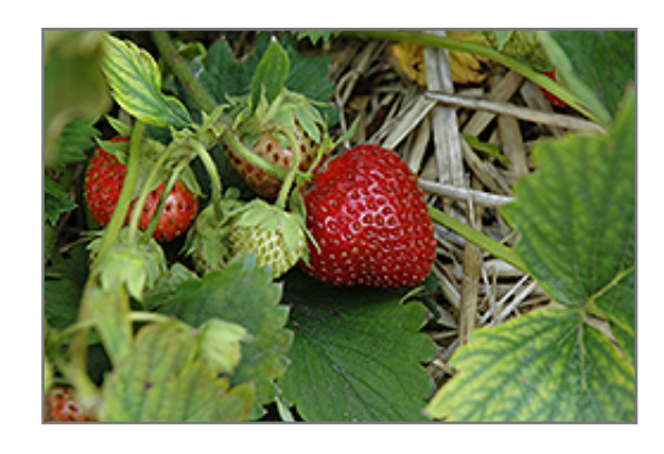
Sparkle Strawberry fruit

Sparkle Strawberry features dainty white daisy flowers with yellow eyes along the stems in mid spring. Its tomentose round compound leaves remain green in colour throughout the season. It features an abundance of magnificent crimson berries from late spring to early summer.