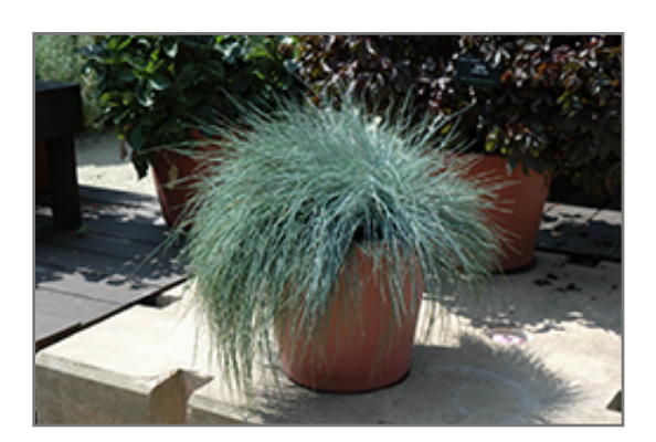
Festina Blue Fescue

Festina Blue Fescue is recommended for the following landscape applications;