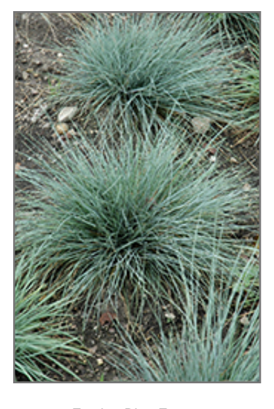
Festina Blue Fescue

This is a relatively low maintenance plant, and is best cleaned up in early spring before it resumes active growth for the season. It has no significant negative characteristics.