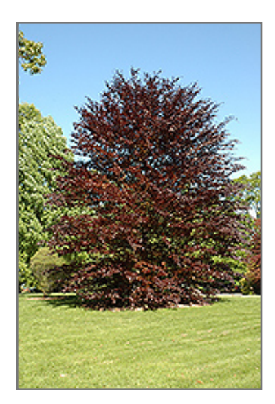
Spaeth Purple Beech