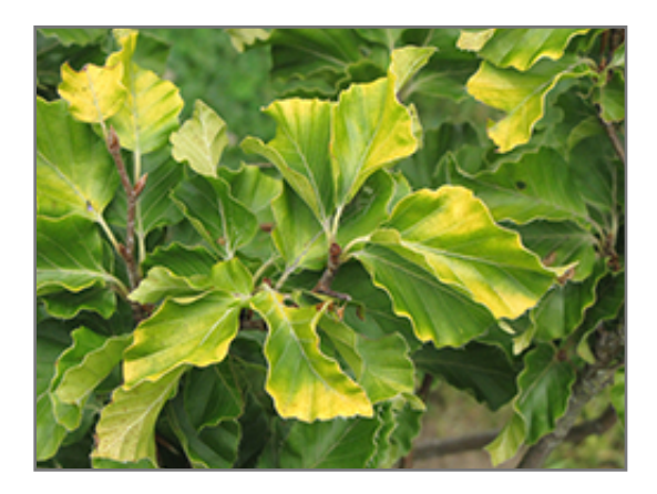
Rohan Gold Beech foliage

Rohan Gold Beech is recommended for the following landscape applications;