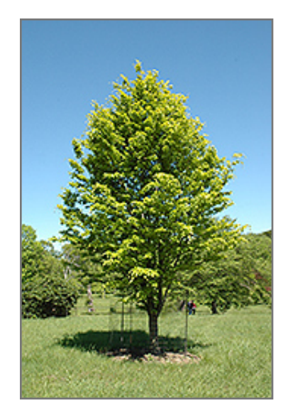
Rohan Gold Beech

This is a relatively low maintenance tree, and is best pruned in late winter once the threat of extreme cold has passed. Deer don't particularly care for this plant and will usually leave it alone in favor of tastier treats. It has no significant negative characteristics.