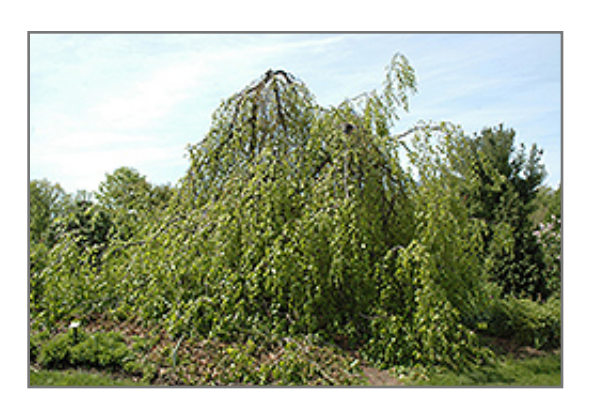
Weeping Beech

Weeping Beech is recommended for the following landscape applications;