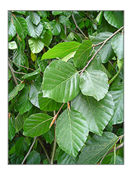
Weeping Beech foliage