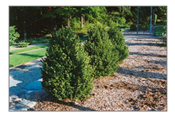
Green Mountain Boxwood

This is a relatively low maintenance shrub, and can be pruned at anytime. It is a good choice for attracting bees to your yard, but is not particularly attractive to deer who tend to leave it alone in favor of tastier treats. It has no significant negative characteristics.