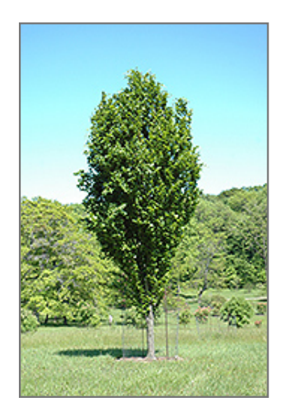
Dawyck Beech