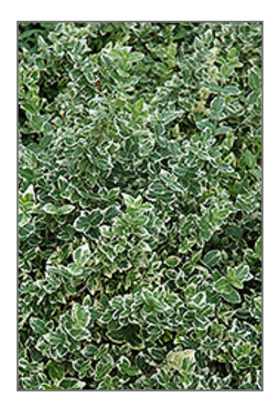
Variegated Wintercreeper foliage