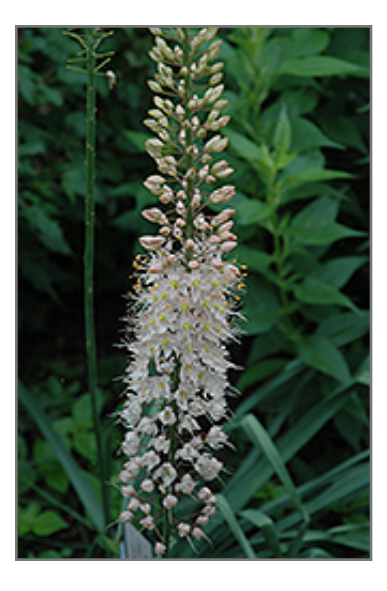
Pretty In Pink Fox Tail Lily flowers

Bold giant spikes of pink flowers rise from grassy foliage; makes a great accent in the garden composition; prefers good drainage; may require staking