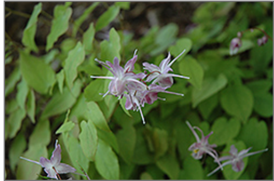
Bishop's Hat flowers

Other Names: Barrenwort, Bishop's Hat, Fairy Wings