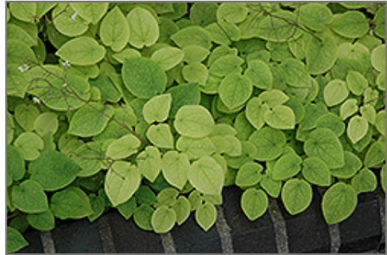
Bishop's Hat foliage

Other Names: Barrenwort, Bishop's Hat, Fairy Wings