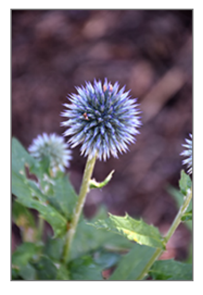
Taplow Blue Globe Thistle flowers

Striking globe-shaped steel-blue flowers steal the show when in bloom; may need staking; not an invasive type of thistle, good for attracting pollinators; do not over-fertilize; soil must be well-drained