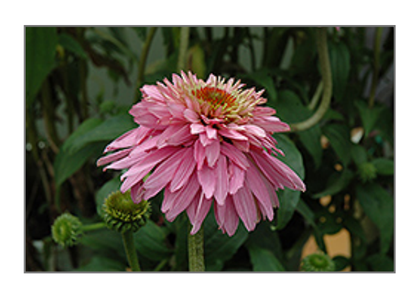
Pink Poodle Coneflower flowers

This fully double echinacea is dahlia-like with its large, 4 "flowers; a vigorous plant with fragrant blooms; great for flower arrangements, attracts pollinators and feeds the birds at winter