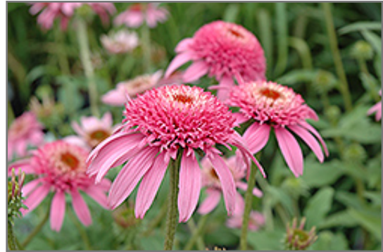
Cone-fections Pink Double Delight Coneflower flowers

Cone-fections Pink Double Delight Coneflower is recommended for the following landscape applications;