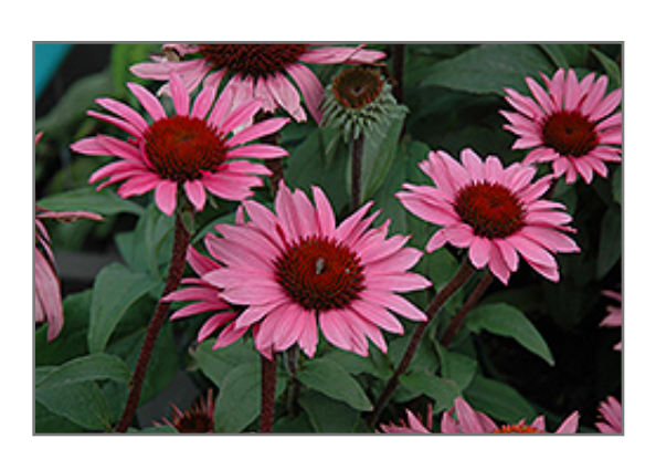
Merlot Coneflower flowers