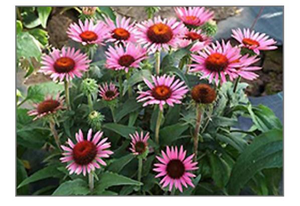
Lilliput Dwarf Coneflower flowers