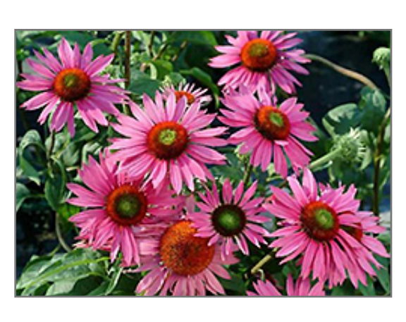
Green Eyes Coneflower flowers

This striking variety has typical pink petals but is unique for its green eye at the center of an orange cone; flowers are fragrant and long-lasting; reblooms with deadheading; great for flower arrangements, attracts pollinators