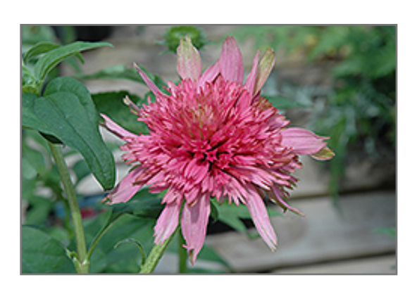
Cotton Candy Coneflower flowers

birds at winter; use in naturalized areas