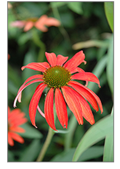
Tomato Soup Coneflower flowers

This is a relatively low maintenance plant, and is best cleaned up in early spring before it resumes active growth for the season. It is a good choice for attracting butterflies to your yard, but is not particularly attractive to deer who tend to leave it alone in favor of tastier treats. It has no significant negative characteristics.