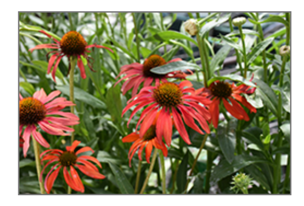
Tomato Soup Coneflower flowers

Tomato Soup Coneflower is recommended for the following landscape applications;