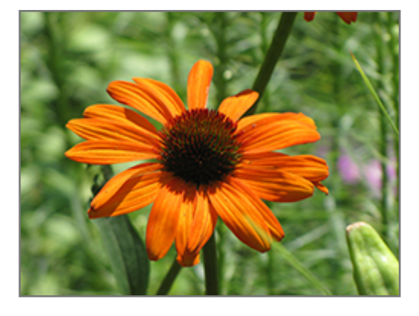
Tiki Torch Coneflower flowers

Tiki Torch Coneflower has masses of beautiful lightly-scented orange daisy flowers with dark red eyes at the ends of the stems from mid summer to mid fall, which are most effective when planted in groupings. The flowers are excellent for cutting. Its pointy leaves remain green in colour throughout the season.