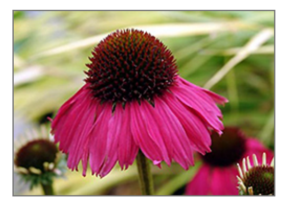
Raspberry Tart Coneflower flowers

Raspberry Tart Coneflower has masses of beautiful lightly-scented rose daisy flowers with orange eves at the ends of the stems from mid summer to mid fall, which are most effective when planted in groupings. The flowers are excellent for cutting. Its pointy leaves remain green in colour throughout the season.