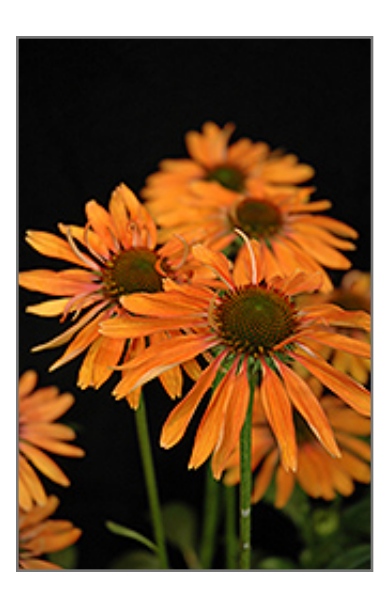
Hot Lava Coneflower flowers

Hot Lava Coneflower has masses of beautiful lightly-scented orange daisy flowers with red overtones and dark red eyes at the ends of the stems from mid summer to mid fall, which are most effective when planted in groupings. The flowers are excellent for cutting. Its pointy leaves remain green in colour throughout the season.