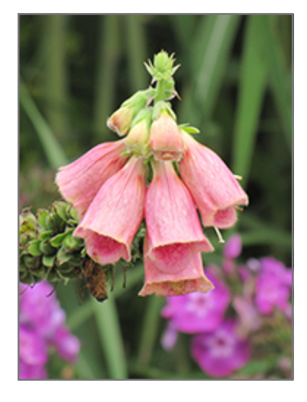
Strawberry Foxglove flowers

Strawberry Foxglove is an herbaceous perennial with a rigidly upright and towering form. Its medium texture blends into the garden, but can always be balanced by a couple of finer or coarser plants for an effective composition.