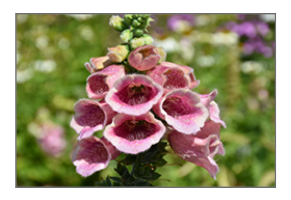
Strawberry Foxglove flowers

This plant will require occasional maintenance and upkeep, and is best cleaned up in early spring before it resumes active growth for the season. It is a good choice for attracting hummingbirds to your yard, but is not particularly attractive to deer who tend to leave it alone in favor of tastier treats. Gardeners should be aware of the following characteristic(s) that may warrant special consideration;