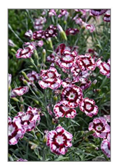
Raspberry Swirl Pinks flowers