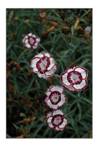
Raspberry Swirl Pinks flowers

This is a relatively low maintenance plant, and is best cleaned up in early spring before it resumes active growth for the season. It is a good choice for attracting bees and butterflies to your yard, but is not particularly attractive to deer who tend to leave it alone in favor of tastier treats. It has no significant negative characteristics.