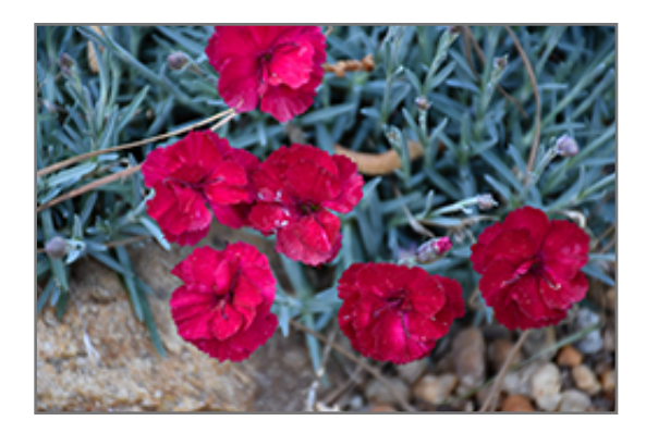
Frosty Fire Pinks flowers

This is a relatively low maintenance plant, and is best cleaned up in early spring before it resumes active growth for the season. It is a good choice for attracting bees and butterflies to your yard, but is not particularly attractive to deer who tend to leave it alone in favor of tastier treats. It has no significant negative characteristics.