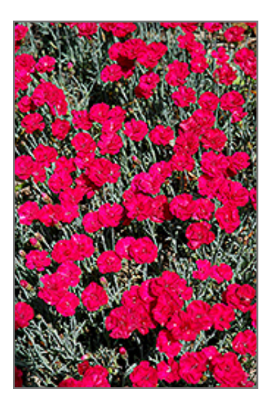
Frosty Fire Pinks flowers

Frosty Fire Pinks is an herbaceous evergreen perennial with a mounded form. It brings an extremely fine and delicate texture to the garden composition and should be used to full effect.