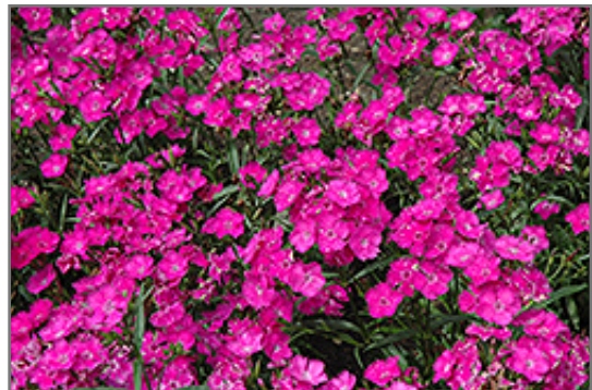
Bouquet Purple Pinks in bloom