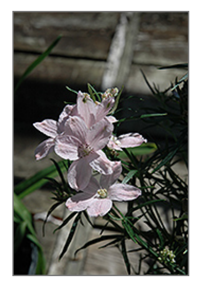
Summer Morning Dwarf Larkspur flowers

Summer Morning Dwarf Larkspur features bold panicles of shell pink flowers at the ends of the stems from early to mid summer. The flowers are excellent for cutting. Its deeply cut ferny leaves remain dark green in colour throughout the season.