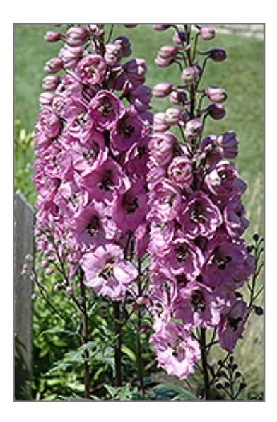
Dusky Maidens Larkspur flowers

Magnificent display of lilac-pink flowers with dark bee, on towering spikes with good vertical form, dense flower spikes and strong stems; excellent uniformity