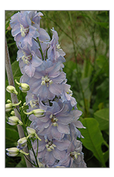
Dreaming Spires Larkspur flowers

Dreaming Spires Mix shows magnificent variation in shades of violet, blue, lilac, white, pink, sometimes with picottee, prominent veins and contrasting bees; on towering spikes that have good vertical form, dense flower spikes and strong stems