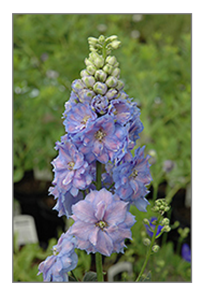
Blue Lace Larkspur flowers