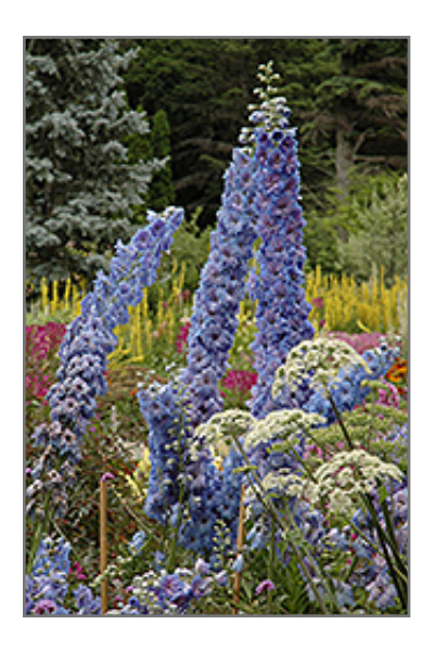
Blue Lace Larkspur flowers