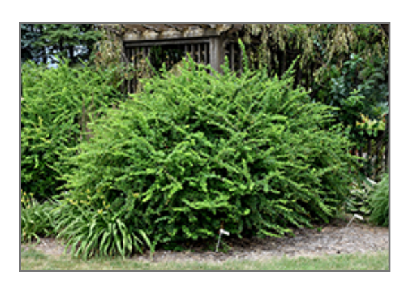
Emerald Carousel Barberry

Emerald Carousel Barberry is recommended for the following landscape applications;