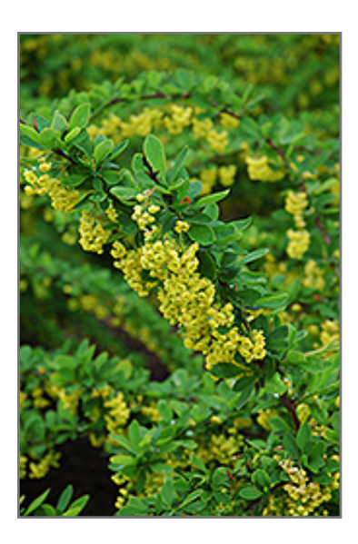
Emerald Carousel Barberry flowers