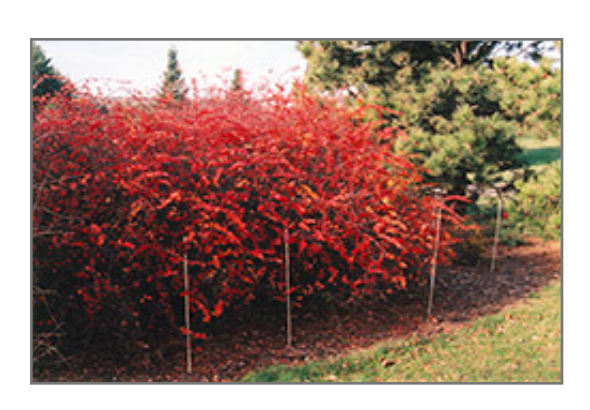
Emerald Carousel Barberry in fall

This shrub does best in full sun to partial shade. It is very adaptable to both dry and moist locations, and should do just fine under average home landscape conditions. It is considered to be drought-tolerant, and thus makes an ideal choice for xeriscaping or the moisture-conserving landscape. It is not particular as to soil type or pH, and is able to handle environmental salt. It is highly tolerant of urban pollution and will even thrive in inner city environments. This particular variety is an interspecific hybrid.