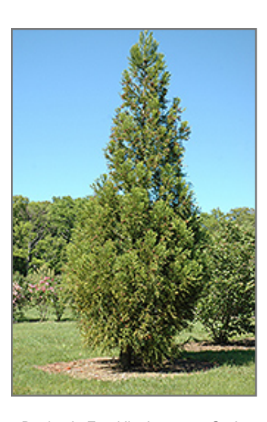
Benjamin Franklin Japanese Cedar

Benjamin Franklin Japanese Cedar is primarily valued in the landscape for its distinctively pyramidal habit of growth. It has attractive bluish-green evergreen foliage. The tiny scale-like sprays of foliage are highly ornamental and remain bluish-green throughout the winter. The peeling antique red bark adds an interesting dimension to the landscape.