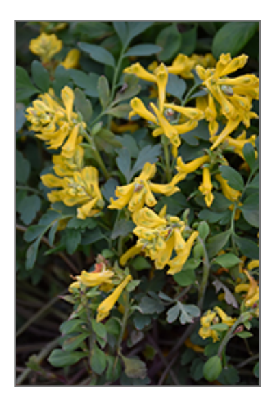
Canary Feathers Corydalis flowers