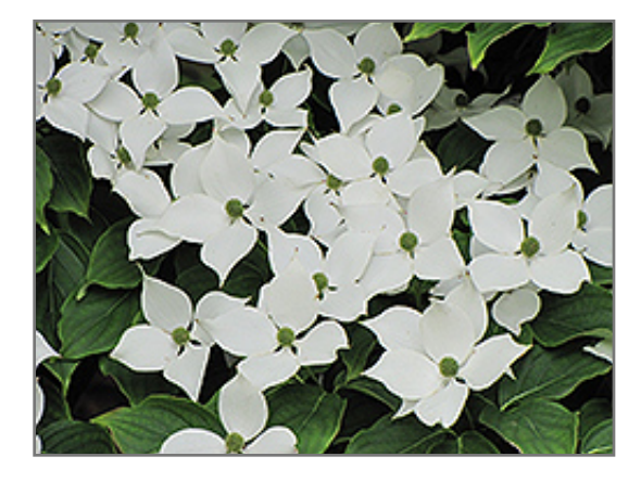
Chinese Dogwood flowers

Chinese Dogwood is a multi-stemmed deciduous tree with a stunning habit of growth which features almost oriental horizontally-tiered branches. Its average texture blends into the landscape, but can be balanced by one or two finer or coarser trees or shrubs for an effective composition.