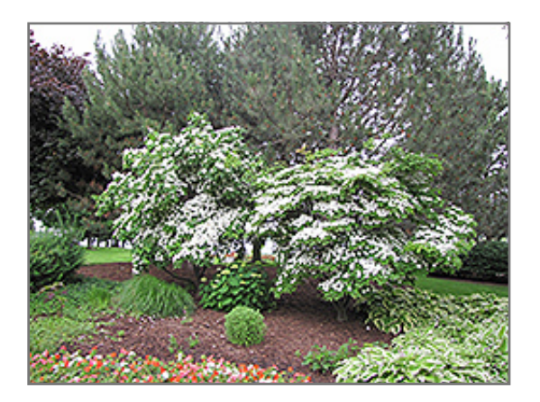
Chinese Dogwood in bloom

This is a relatively low maintenance tree, and should only be pruned after flowering to avoid removing any of the current season's flowers. It is a good choice for attracting birds to your yard. It has no significant negative characteristics.