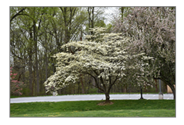
Springtime Flowering Dogwood in bloom