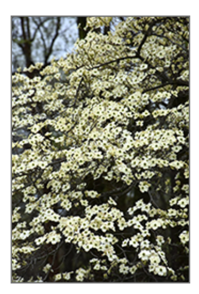
Springtime Flowering Dogwood flowers

This is a relatively low maintenance tree, and should only be pruned after flowering to avoid removing any of the current season's flowers. It is a good choice for attracting birds to your yard. Gardeners should be aware of the following characteristic(s) that may warrant special consideration;