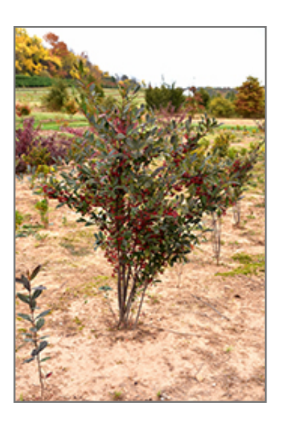
Brilliantissima Red Chokeberry fruit

This shrub should only be grown in full sunlight. It is an amazingly adaptable plant, tolerating both dry conditions and even some standing water. It is not particular as to soil type or pH, and is able to handle environmental salt. It is somewhat tolerant of urban pollution. This is a selection of a native North American species.