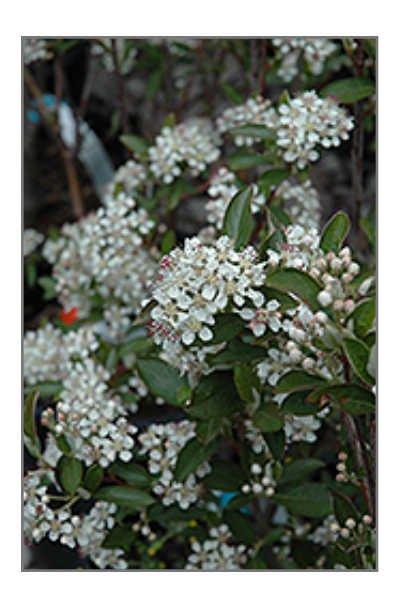
Brilliantissima Red Chokeberry flowers