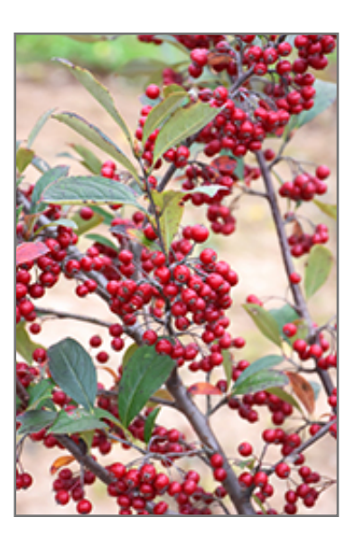
Brilliantissima Red Chokeberry fruit