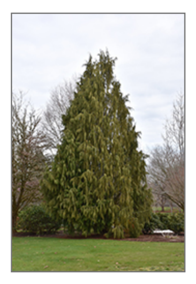
Weeping Nootka Cypress