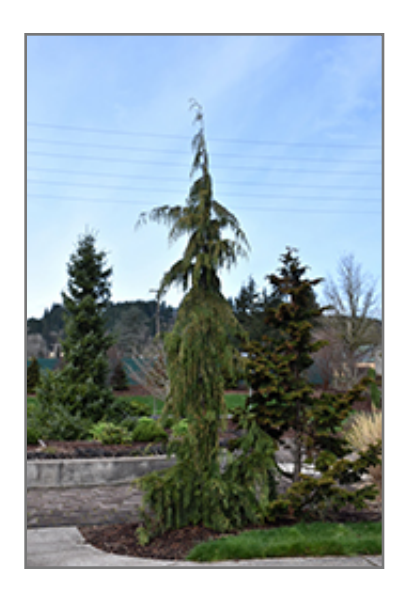
Weeping Nootka Cypress