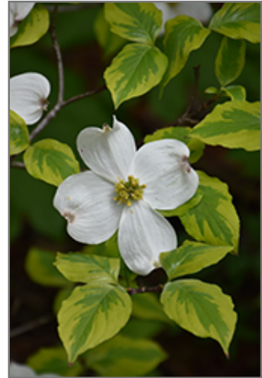
Rainbow Flowering Dogwood flowers

This tree does best in full sun to partial shade. You may want to keep it away from hot, dry locations that receive direct afternoon sun or which get reflected sunlight, such as against the south side of a white wall. It requires an evenly moist well-drained soil for optimal growth, but will die in standing water. It is very fussy about its soil conditions and must have rich, acidic soils to ensure success, and is subject to chlorosis (yellowing) of the foliage in alkaline soils. It is quite intolerant of urban pollution, therefore inner city or urban streetside plantings are best avoided, and will benefit from being planted in a relatively sheltered location. Consider applying a thick mulch around the root zone in winter to protect it in exposed locations or colder microclimates. This is a selection of a native North American species.