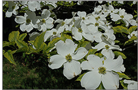
Rainbow Flowering Dogwood flowers

Rainbow Flowering Dogwood is a multi-stemmed deciduous tree with a stunning habit of growth which features almost oriental horizontally-tiered branches. Its average texture blends into the landscape, but can be balanced by one or two finer or coarser trees or shrubs for an effective composition.