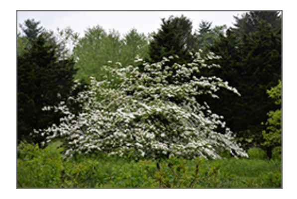
Ruth Ellen Flowering Dogwood in bloom

This is a relatively low maintenance tree, and should only be pruned after flowering to avoid removing any of the current season's flowers. It is a good choice for attracting birds to your yard. It has no significant negative characteristics.