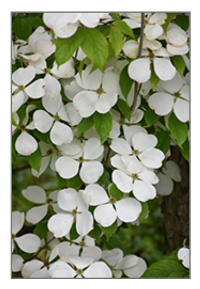
Ruth Ellen Flowering Dogwood flowers

Ruth Ellen Flowering Dogwood is a multi-stemmed deciduous tree with a stunning habit of growth which features almost oriental horizontally-tiered branches. Its average texture blends into the landscape, but can be balanced by one or two finer or coarser trees or shrubs for an effective composition.