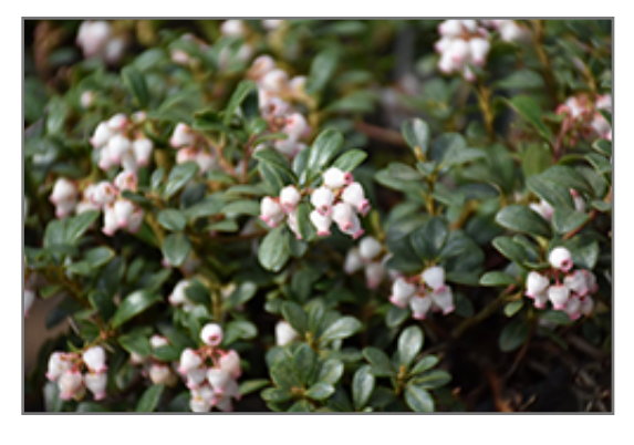
Massachusetts Bearberry flowers

Massachusetts Bearberry will grow to be about 12 inches tall at maturity, with a spread of 4 feet. It tends to fill out right to the ground and therefore doesn't necessarily require facer plants in front. It grows at a slow rate, and under ideal conditions can be expected to live for approximately 20 years.