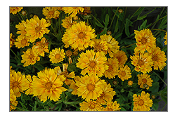
Jethro Tull Tickseed in bloom