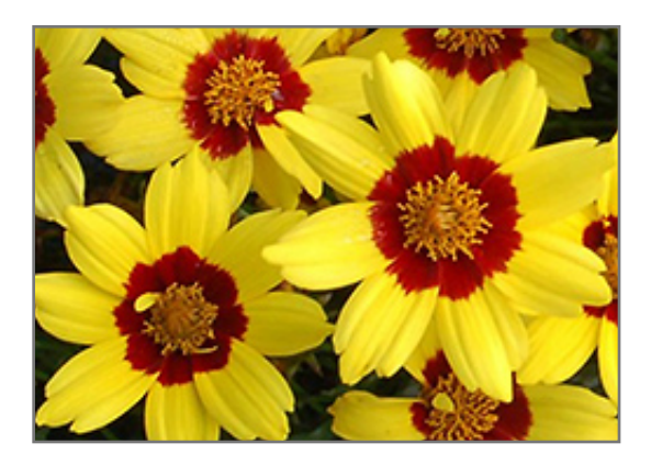
Gold Nugget Tickseed flowers